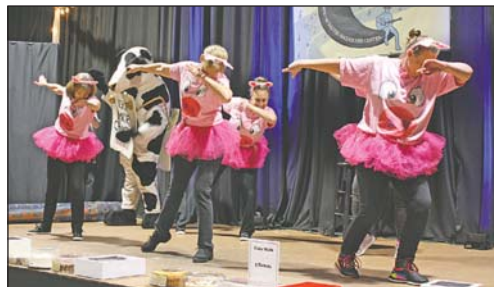
"The Dancing Pigs," with a little help from the Chick-Fil-A Cow, cap off their dance routine to Dolly Parton's "9-5."