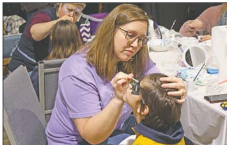
The face painting table was one of the most popular attractions at the Great Cake Bake.